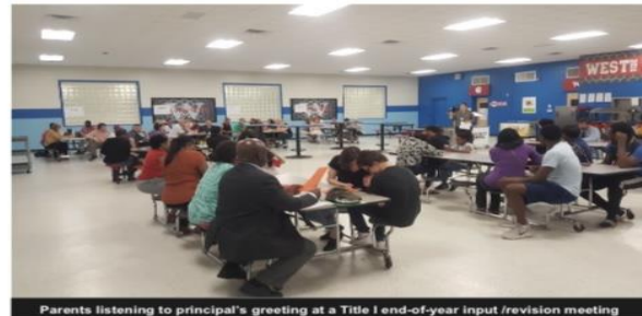
Parents listening to principal's greeting at a Title I end-of-year input/revision meeting